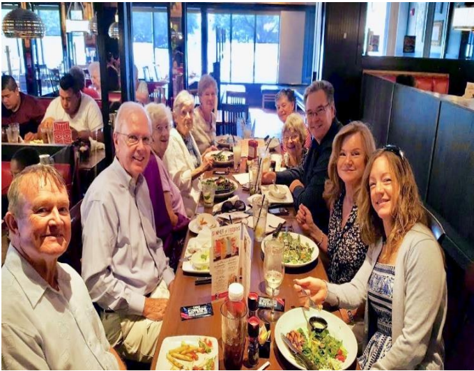
A good time was had by all on Sunday, July 23. We lunched at TGI Fridays before touring Montpelier.