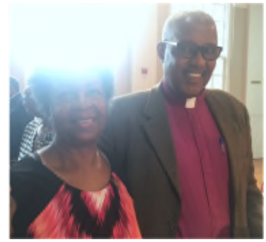
The Rt. Rev. E. Ambrose Gumbs

ERD provides the best source of help for rebuilding the Islands' infrastructure and getting needed resources to them.